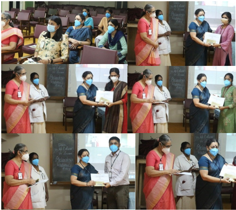
Medical Superintendent distributing the prizes