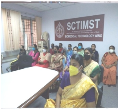
Staff at BMT Wing including contract workers and at AMCHSS , mainly post graduate and doctoral students attending the talk