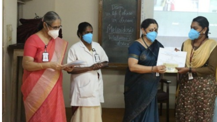
Prizewinning posters at AMCHSS