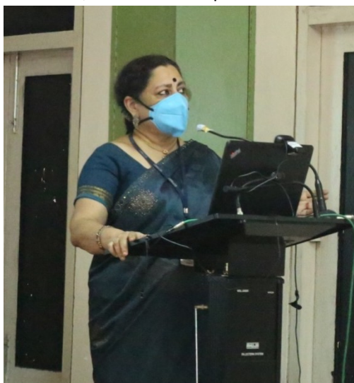
Medical Superintendent addressing the gathering