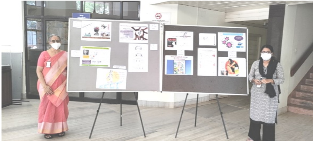
Display of prizewinning posters at AMCHSS