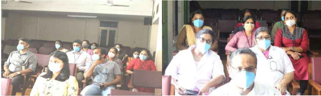
Staff at Hospital Wing attending the talk

categories including doctors, nurses, scientists, technicians, administrative staff and contract employees attended the talk. The talk was mostly in Malayalam , hence understood by all.